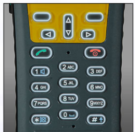
Robust, shock-resistant housing, illuminated keypad with good differentiation for use when wearing gloves