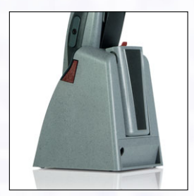
Charger with additional charging slot for second battery

www.funkwerk-sc.com info@funkwerk-sc.com